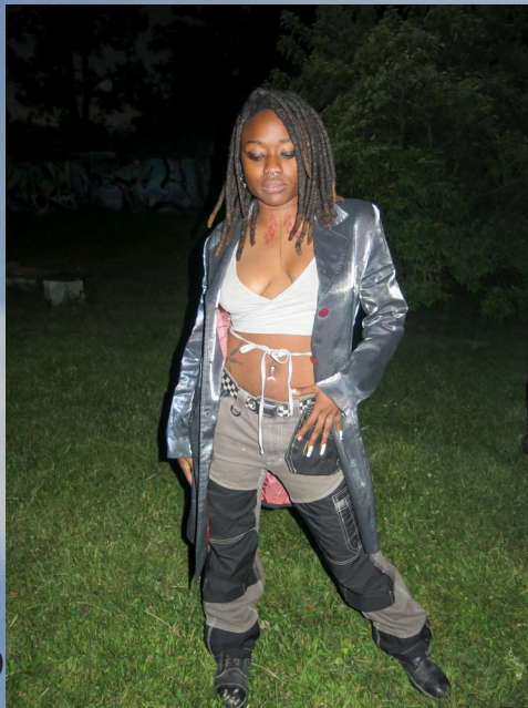
@ Humboldt Forest