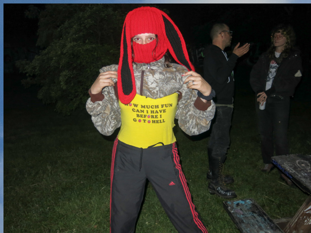
@ Humboldt Forest