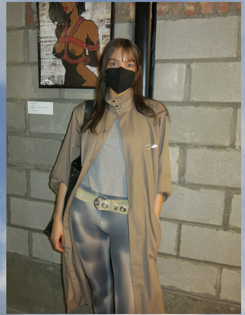
@ East Side Art Show

Summertime is making time for bathing suits and water shoes, it's figuring out which fabric feels the best on your skin during especially humid days. Summer is halfway through and Detroit has been active. Every park I see is full of families and friends and couples doing all kinds of activities. The dancefloors are full of colorful sparkly people and hearts are being filled and broken all over the place. Summer isn't over yet but I've notice a few trends that speak to me. The freakification of cargo pants/workwear/camo/real tree attire still prevails in the club scene and I'm not mad at it! People look sexy and "capable of survival" in these remixed workwear/hunting gear. In this End of Empire era we're all living through, survival is like, really hot!! Another