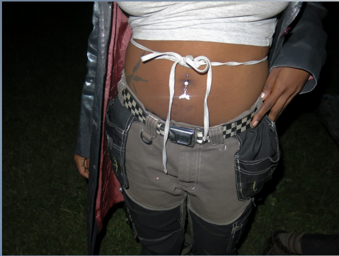
@ Deep East