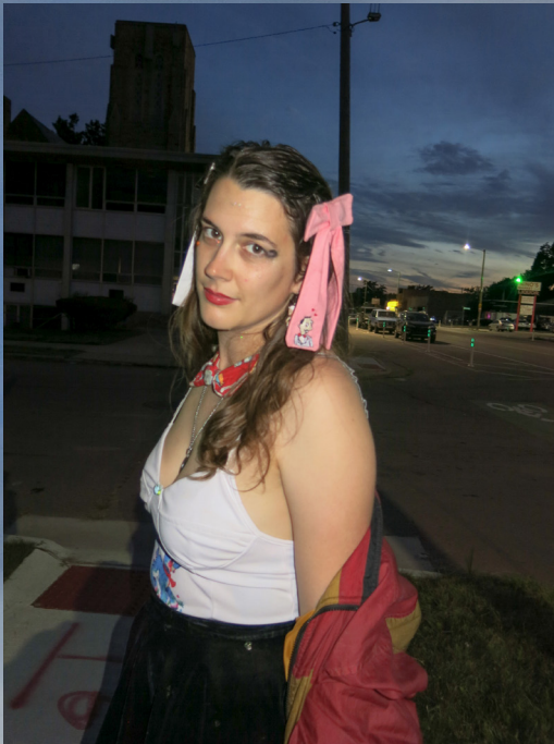
@ East Side Art Show