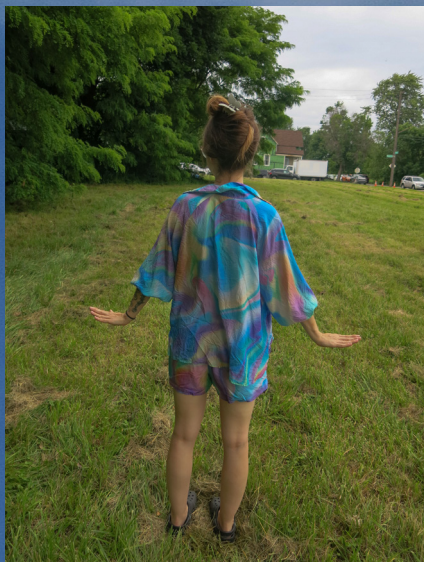
@ Ambient Party SW